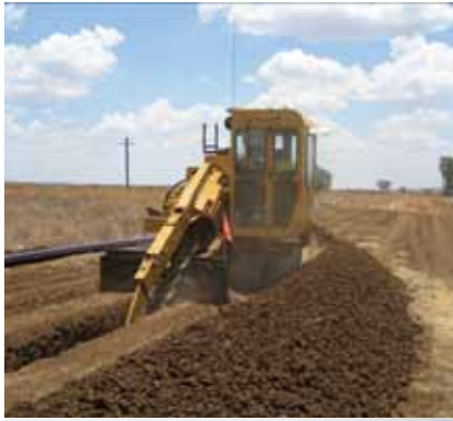
Trenching the nearly 8 miles (13km) of pipe that moves the effluent from holding ponds onto area crops.