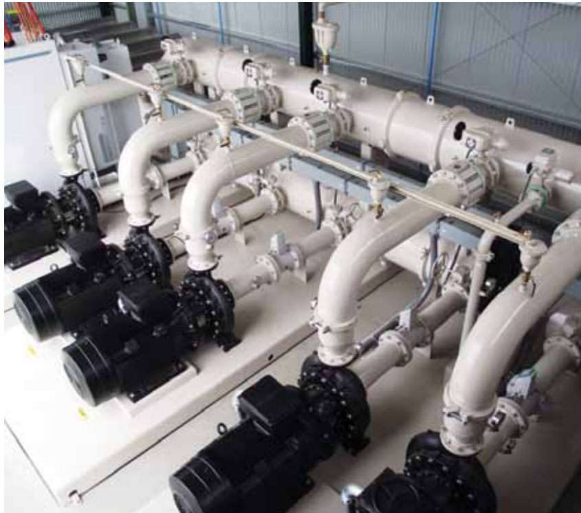
To conserve land and water resources, a Watertronics pump station (above) and 13 new Zimmatic center pivots were installed to irrigate local crops with the town's treated wastewater.

In addition, the project required accurate recording of the volume of wastewater applied through the pivots, high rainfall shutdown capabilities and "burst pipe" alarms.