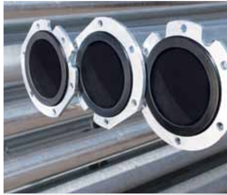
Zimmatic poly-lined pipes, perfect for corrosive water conditions, were used for the project.