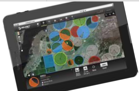
FieldNET™ Wireless Irrigation Management