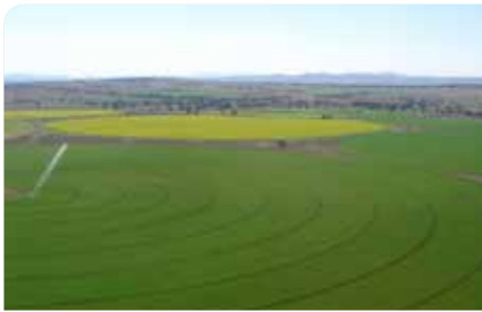
Alfalfa (lucerne) (foreground) and flowering canola (background) are among several crops irrigated at Tamworth.