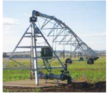
One of the 13 new Zimmatic poly-lined center pivots at Tamworth.

1,585 million gallons per year (6,000 ML/year), with future expansion capabilities built into the system if needed.