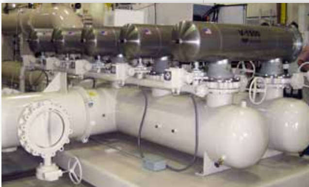
The pump station was custom-engineered and performance-tested, as shown above, at the Watertronics facility in Hartland, Wisconsin, USA.